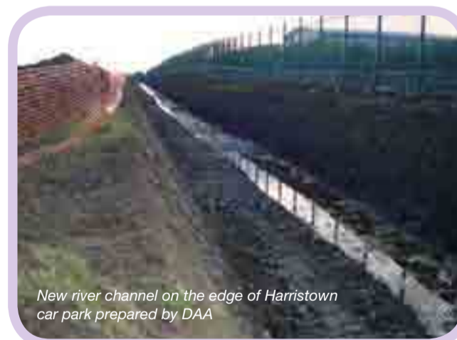
New river channel on the edge of Harristown car park prepared by DAA

Some decorative plasterwork from Corballis House will be featured within T2 and video on the history of Corballis House and the work to salvage its most important features will be shown in the new terminal.