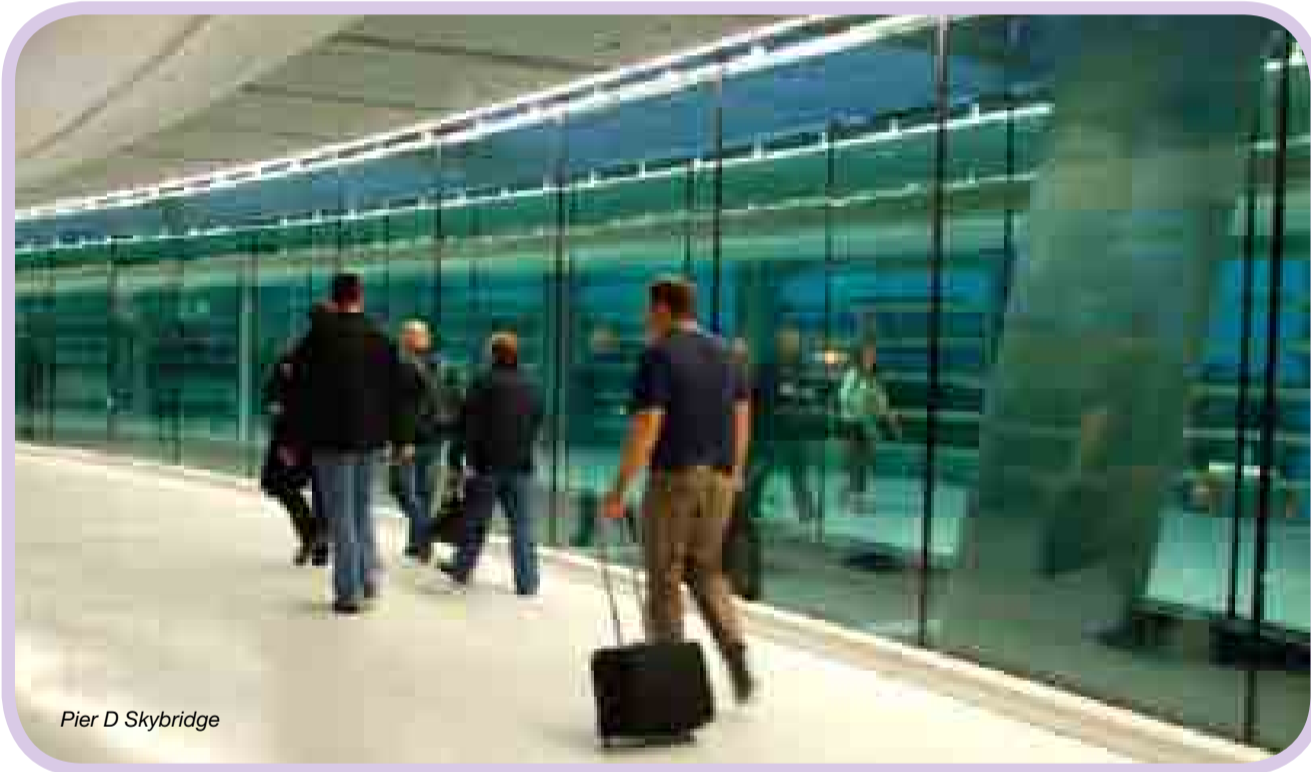
Pier D Skybridge

The DAA's diversion of the stream should actually improve its ability to support wildlife. "The stream will probably end up in a better condition in the new diversion than it is currently," according to the DAA's ecological consultant on the project Eleanor Mayes. The new stream could eventually support a wide range of sticklebacks and eels and also the larval stages of insects.