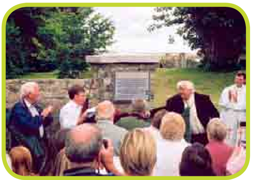
Cloghran Historical Society and residents mark the refurbishment of Cloghran Graveyard