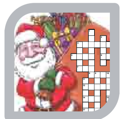
CROSSWORD COMPETITION Page 8