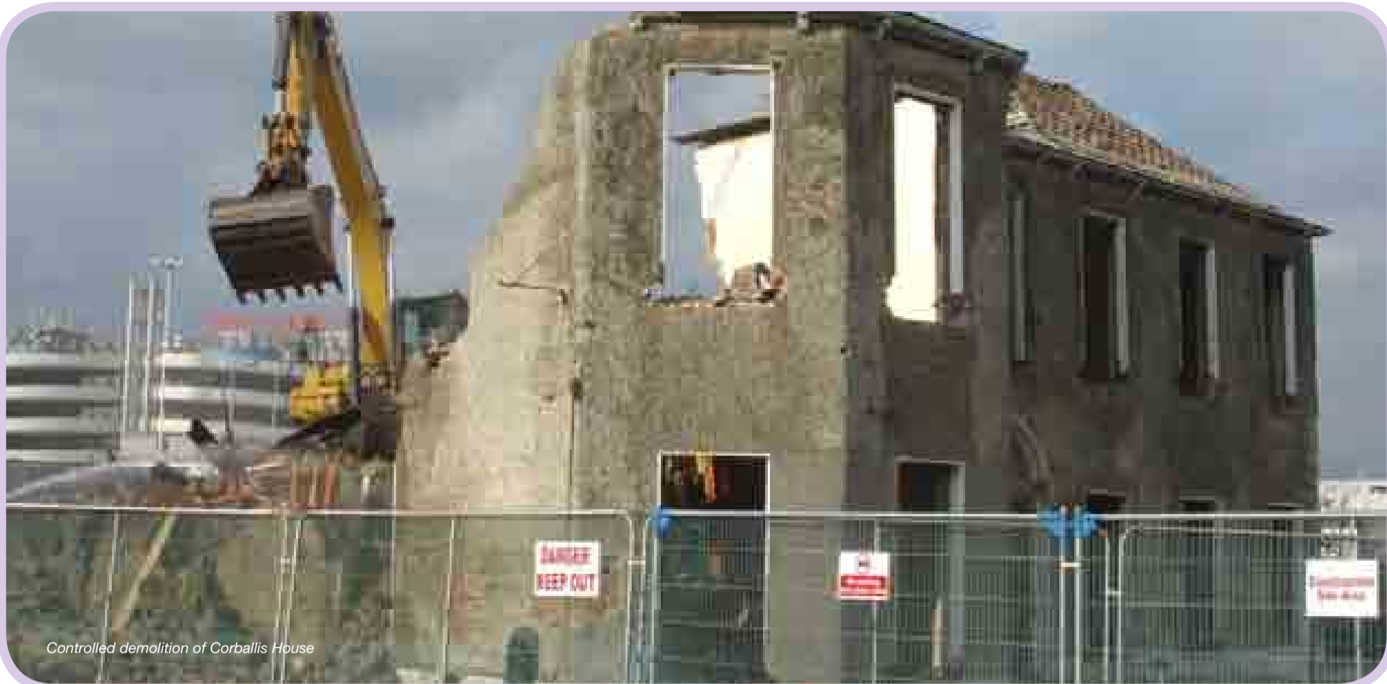
Controlled demolition of Corballis House

The DAA has already signed seven T2 contracts worth about €180m and once the site has been cleared construction work will start in earnest. To minimise disruption to passengers and our neighbours a dedicated new road will be built for access to and from the T2 construction site and a site logistics compound is being created behind ALSAA where large deliveries for the works will be stored and broken up into smaller loads.