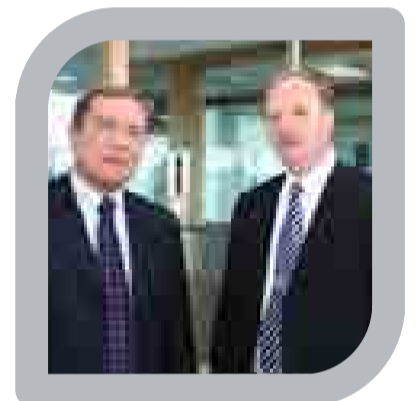
TRANSFORMING AIRPORT Page 4