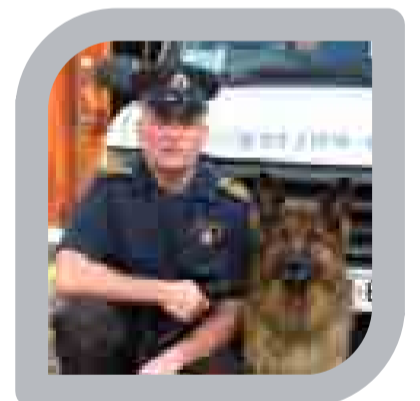
ONE MAN AND HIS DOG Page 6