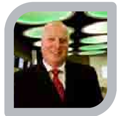
WELCOME Page 2

A large glass panel, featuring the image of a famous Irish writer and an extract from one of their works, is located at each end of the 12 boarding gates in Pier D.