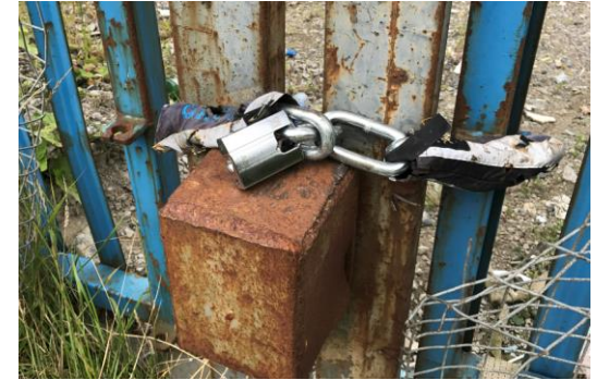
Sample of damage to locks